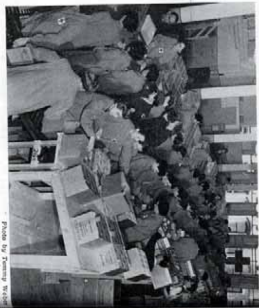
Conveyor line carries Red Cross food packages to gluing machine.

At the present time the food packing centers at Philadelphia, New York, and Chicago, operated by the American Red Cross with the aid of volunteer women workers, are producing more than 600,000 food packages a month; and the volunteers can have the satisfaction of knowing that each parcel they have filled will be opened with a hearty welcome by the prisoner of war at the other end of the line.