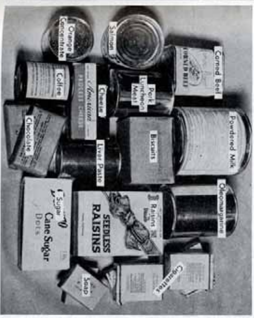
The contents of an American Red Cross standard food package

A list of the contents of this special package, which will be of the same size and weight as the standard food package, will be published later. They will be such, however, as to remind our prisoners of former Christmases spent under happier circumstances, and of the fact that, if we cannot have them with us in person this year, we shall be with them in spirit.