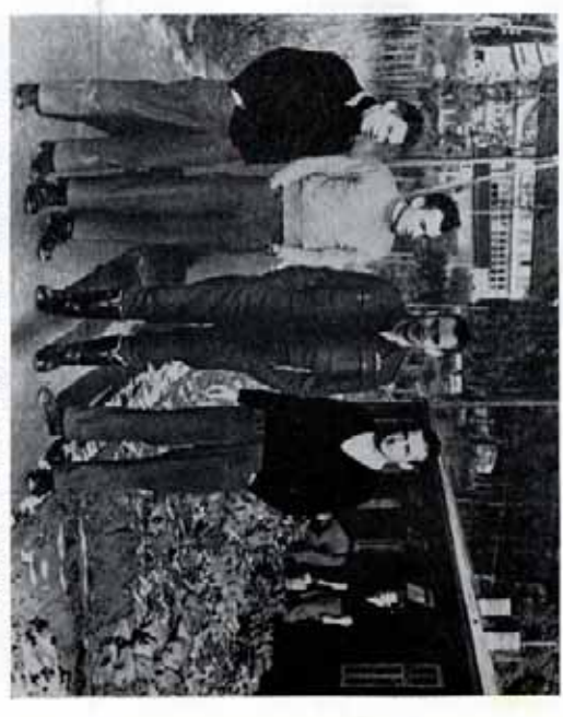
Group of American aviators await the war's end in Stalagluft III

veyor. The empty carton starts on its journey along the conveyor line and the first volunteer puts into it a one-pound packet of prunes or raisins. It proceeds further, and the next volunteer puts in a tin of liver pate; then there is tucked into one corner a tin of soluble coffee, into another a can of corned beef. Then there are added, rapidly, a packet of sugar, a can of dried milk, a can of oleomargarine, a packet of peanut butter, a can of orange concentrate, a packet of cheese, a can of salmon, several packets of cigarettes, a couple of bars of soap, and a couple of bars of chocolate.