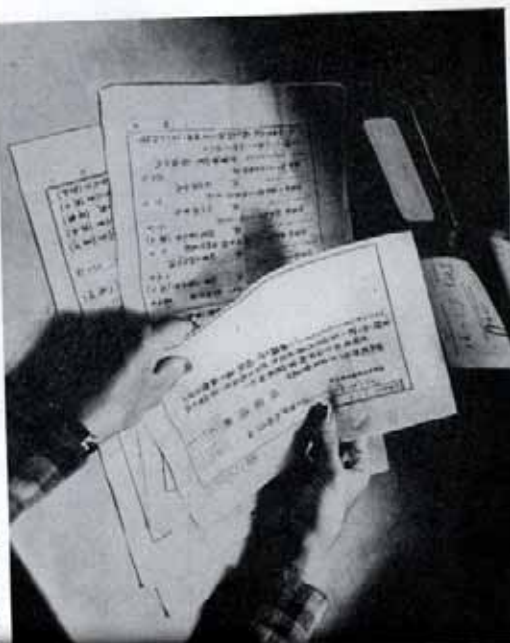
A list of American prisoners of war, compiled about forty names, as sent by the Japanese Government's General Information Bureau at Tokyo to the Central Agency for Prisoners of War in Geneva.

The only method on which agreement has so far been reached for the transportation of relief supplies was by diplomatic exchange ships, which went from various United Na-