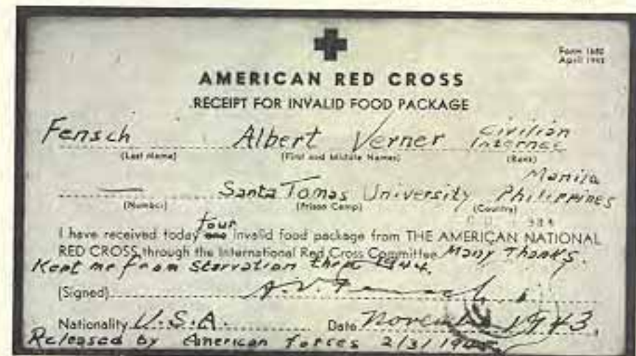
Receipt card for Red Cross food packages delivered at Santa Tomas in November 1943. The card was mailed after the internees were released in February.