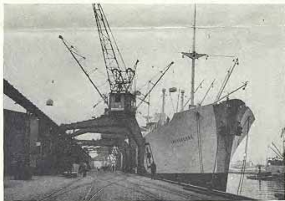
Unloading prisoner of war supplies from the M. S. Travancore at Göteborg, Sweden, for transshipment to Germany.

The remaining 19 trucks in the convoy which left Switzerland in early March proceeded to the Carlsbad-Marienbad region (in what is frequently called the Sudetenland), carrying food and medical supplies to meet the large body of prisoners marching from camps in the Silesian region (such as Stalag VIII B, Stalag 344, WK 8 B.A.B. 20 and 21, and so forth). A second convoy of 48 American Red Cross and Canadian Red Cross trucks went forward from Switzerland in 4 columns of 12 trucks each on March 17, 18, and 19.