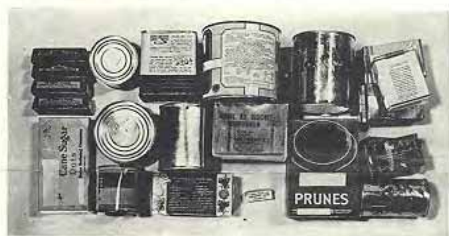
Contents of an American Red Cross standard food package.

The various items in the standard food package are planned, in the first instance, by the Red Cross Nutrition Service in consultation with the Office of the Medical Director. Each package, including wrappings and outside container, weighs 11 pounds. While the selection of items for the package is largely dependent on the availability of foods and of the packaging materials to keep them in first-class condition, the sort of food the prisoners liked and were used to eating at home is chosen insofar as this is possible. Each package must, however, provide the greatest possible amount of nourishment. The packages are planned to supplement the camp and hospital diets, which are likely to consist largely of