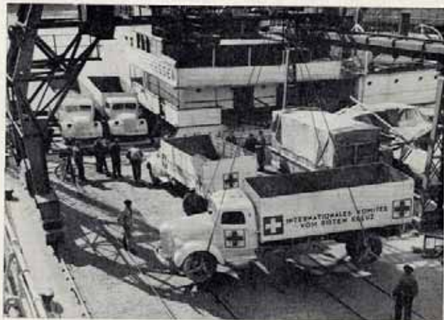
Swedish trucks leaving Göteborg for Lübeck, Germany. These trucks, mainly marked in German, International Committee of the Red Cross, were used for delivering relief supplies to camps and marching columns in northern Germany.