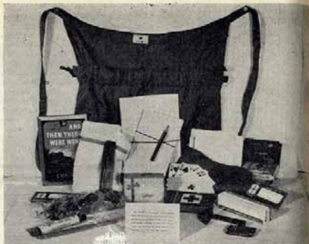
For use on the journey home, Red Cross release kits are distributed to American prisoners.

Machines, the marvels of modern inventive ingenuity, cannot take the place of human beings. In the final analysis, manpower will win the war, and, for victory, precious personnel will continue to be lost. The Navy is keenly aware of the fact that nothing can compensate for the loss of those dear to us. The countless billions the war is costing in materiel seem infinitesimal when we learn of a loved one's death. The American people are facing the sacrifices war entails with bravery and fortitude.