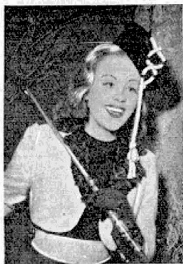
This lovely creature is a German peacetime product, a nice contrast to such local wartime items as barbed wire, black bread and 89's. Peace it's wonderful. We don't know her name. Does it matter?